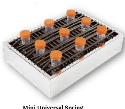
Mini Universal Spring Platform