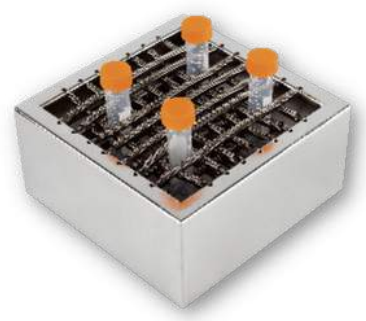
Mini Universal Spring Platform