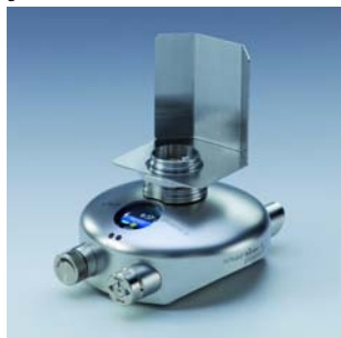
schuett phoenix II with flame shield