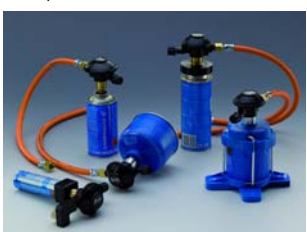
Choice of gas cartridges with adapters, partially including pressure reducer and gas-safety hose.