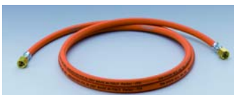
Gas-safety hose for propane/butane, screwed (DVGW-certified)

Sources of energy? You need it - we have it