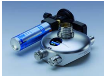
schuett phoenix II with CV 360-adapter incl. pressure reducer and cartridge

Sources of energy? You need it - we have it