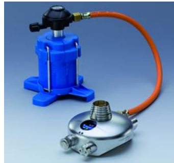
schuett phoenix II with C 206-adapter incl. pressure reducer and gas-safety hose as well as cartridge