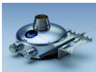
Instrument tray with inoculating loop holder, rotatable for optimum workplace convenience