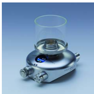
schuett phoenix II with glass spatter guard