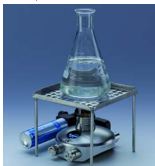
Hot-Tray with schuett phoenix II and CV 360-adaptor/cartridge for operation in chemical lab (height-optimized)