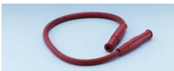
Gas-safety hose for natural gas, slip-on (DVGW-certified)

If the flame stops due to e.g. spilled liquids and the burner may not be re-ignited, the gas supply is automatically and permanently shut.